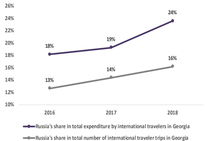
Graph 2: International traveler trips from Russia in Georgia

During 2016-2018, the expenditures spent by international travelers from Russia to Georgia were increasing. In 2018, Russians spent 1.8 mlrd GEL in Georgia, that was 66.8% more compared to 2017.