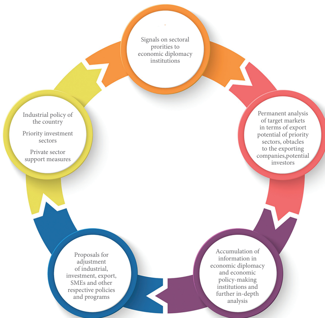
SCHEME 1: The interlinkage between industrial policy and economic diplomacy

The scheme below illustrates the links between the national economic policies and economic diplomacy: