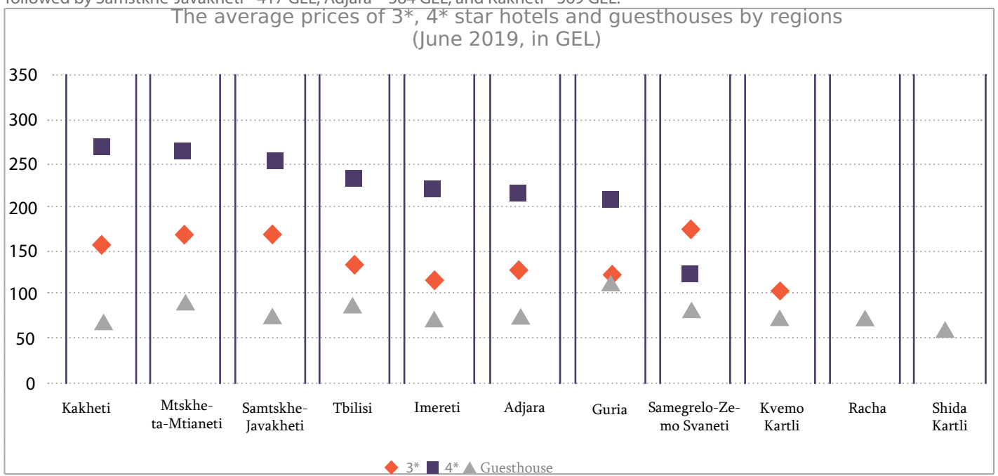
Graph 1 : In the graph, average prices for standard double rooms in 3 and 4-star hotels and guesthouses are given by region. 5-star hotel prices are provided above.

The average cost of a room in a 5-star hotel in Georgia in June 2019 was 448 GEL per night. In Tbilisi, the average price was 618 GEL, followed by Samstkhe-Javakheti - 417 GEL, Adjara – 384 GEL, and Kakheti - 369 GEL.