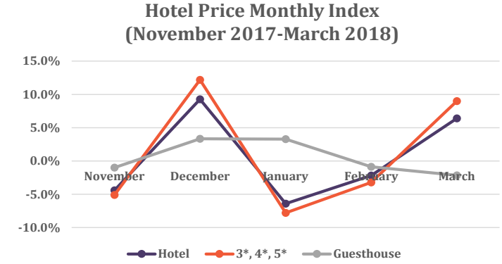
Graph 2: Montlhy Hotel Price Index

After a hotel price increase of 9.3% in December 2017 (compared to November 2017), there was a decrease in both January and February before another monthly hotel price increase was recorded in March-6.4%. In the first two months of 2018, the prices of standard double hotel rooms declined compared to the previous months.