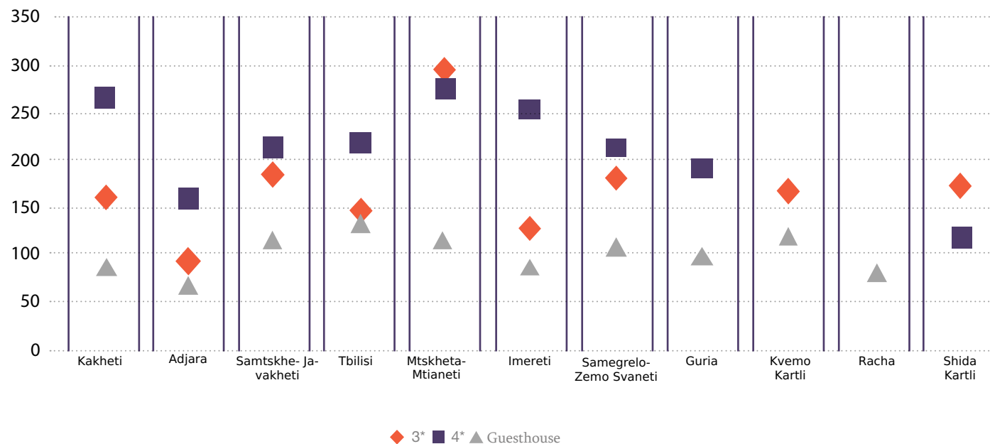
Graph 2: In the graph, average prices for standard double rooms in 3 and 4-star hotels and guesthouses are given by region. 5-star hotel prices are provided below.

The average cost of a room in a 5-star hotel in Georgia in November 2021 was 395 GEL per night. In Kakheti, the average price was 555 GEL, followed by Tbilisi - 544 GEL, Guria - 397 GEL and Adjara - 354 GEL.